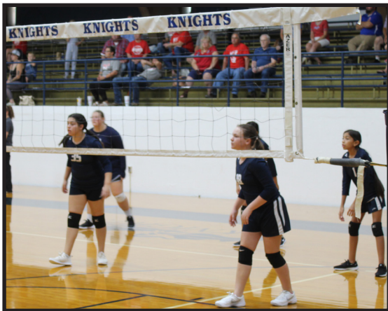
The Junior High volleyball team warms up for the game against Southeast of Saline.