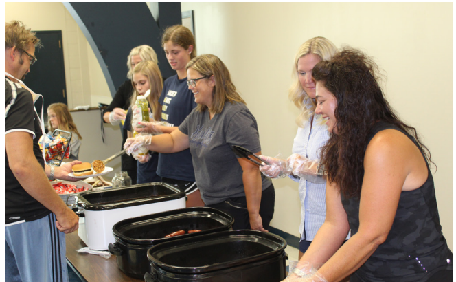
Volunteers helped serve the families dinner during the 7th Grade Orientation night that is held annually to help new 7th grade students become familiar with the school