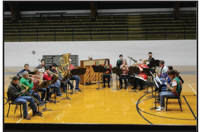
Members of the High School Jazz Band perform during their Christmas Concert on Dec. 14.