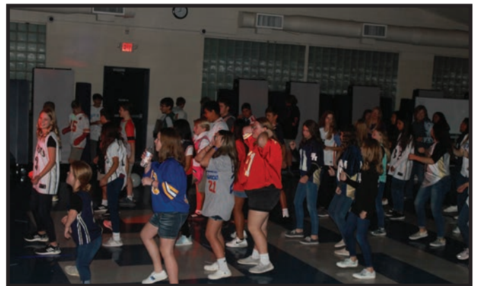
Junior high students during their Fall Dance held on November 5th. The theme for the dance was jerseys, as each student was encouraged to wear a jersey of their favorite sports team.