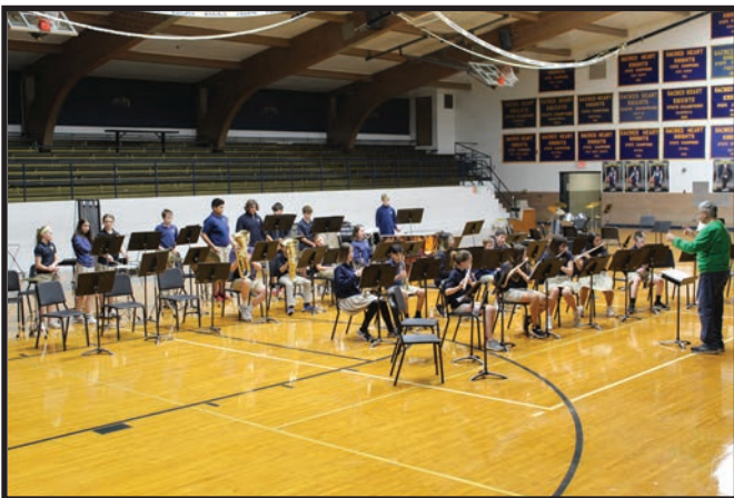
The Junior High School Concert Band perform during the Christmas Concert on December 14th.