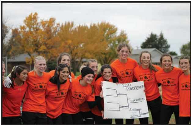
The Sophomore girls were crowned champions of the 2021 PowderPuff Football tournament.