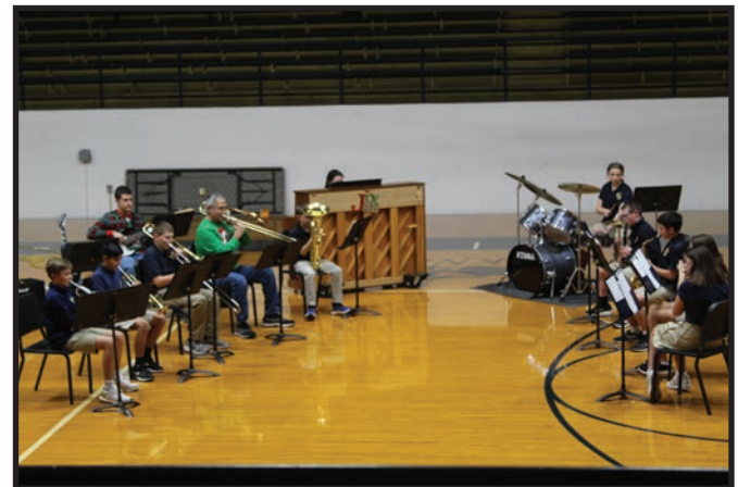
The Junior High Jazz Band perform during the Christmas Concert on December 14th.