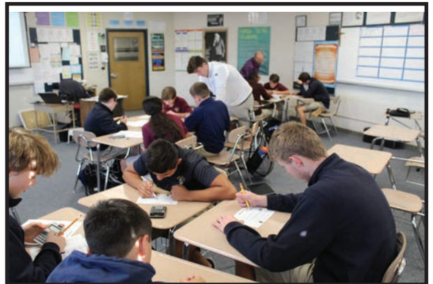
JH students are preparing for the Math Counts competition by practicing Math problems every Wednesday after school. The Math Counts Competition is scheduled for February 5th.