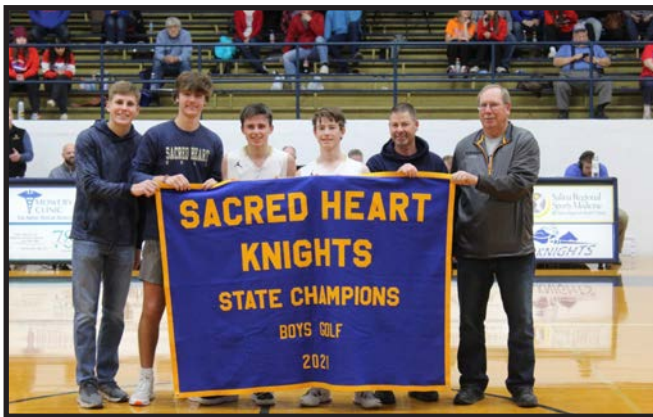
Members of the Varsity Boys golf team pose with their State Championship Banner. This is the 6th consecutive championship for the golf team.