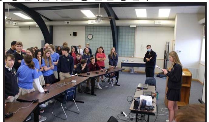
During the February Community Competition a round of Trivia was held. The community of John Paul II was victorious in the monthly contest.