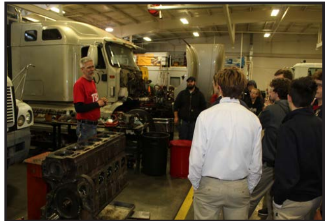
During their trip to Salina Tech, the sophomores received a tour of the Diesel Technology Department.