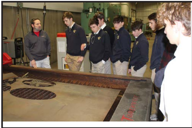
Sophomores inspect a CNC Metal Plasma Arc Cutting Machine at Salina Tech.