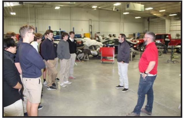
Sophomores listen to instructors from the Auto Body department at Salina Tech during a recent trip to learn programs and career opportunities.