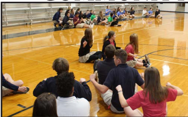
Students participated in a game of Ships and Sailors during the February community competition.