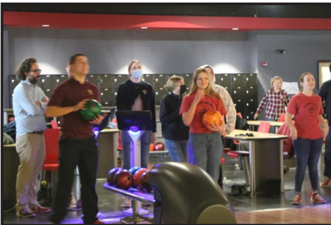
Students had the opportunity to attend The Alley on Thursday during Catholic Schools Week for an afternoon of fun.