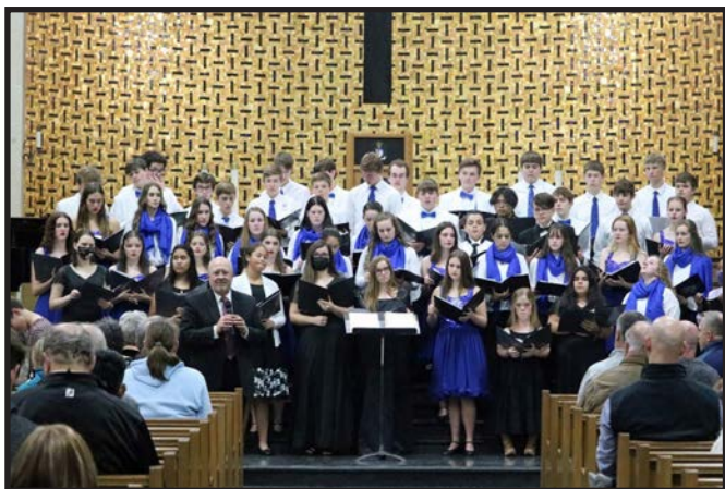
Members of the Sacred Heart Choir joined with other schools in the Diocese to perform a Vocal Concert on Jan. 30. at the Cathedral.