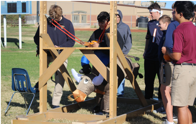
Students brought mini pumpkins and goards to launch using the student built catapult. A winner was determined on who was able to launch their goard closest to a target.