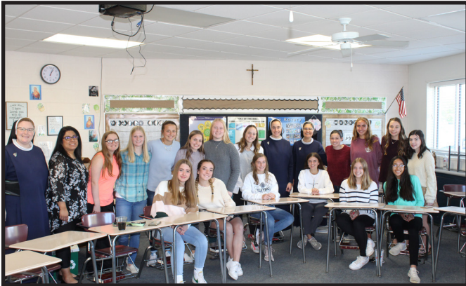
Members of the Sacred Heart's FIAT, (Latin for "Let it be done") meet at school with the Sisters of the Immaculate Heart of Mary of Wichita on October 21st.