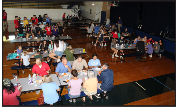
Many families and students enjoyed the homecoming BBQ sponsored by the Sacred Heart Booster Club.